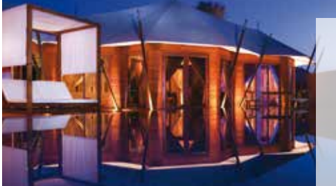
Sleep in a luxurious tent in the desert The Ritz-Carlton, Ras al Khaimah, Al Wadi Desert