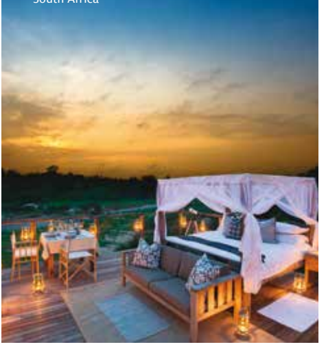
Spend the night in a treehouse Lion Sands Game Reserve, South Africa